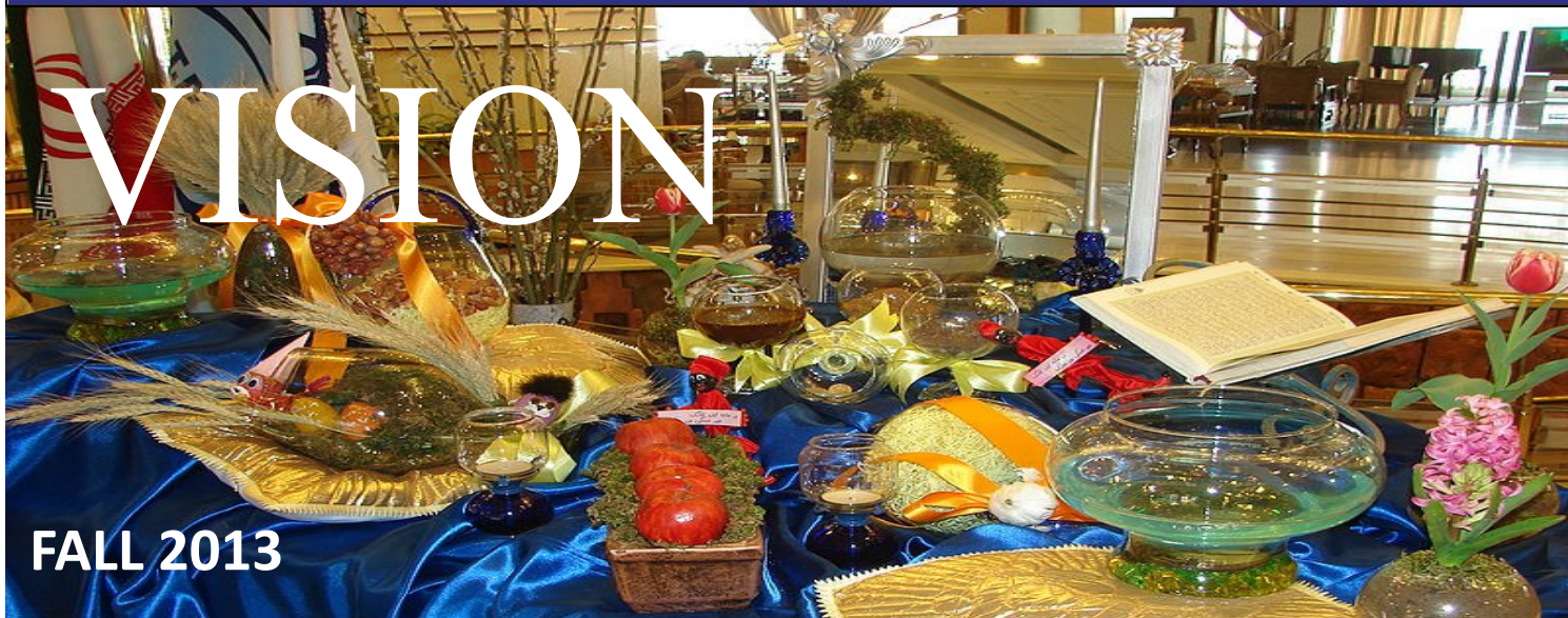
a Haft Sen Table as seen at Laleh Hotel, Tehran