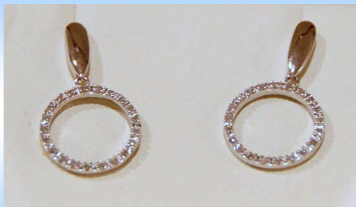
Second Prize: Diamond Earrings in a 14K White Gold Setting Valued at $1025