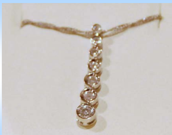
Third Prize: Diamond Necklace in a 14K White Gold Setting Valued at $890

Tickets are $25 each for the raffle. When purchased at the Gala, the ticket comes with a glass of Champagne. Draw will be held at the OZCF Gala on May 23rd, 2009.