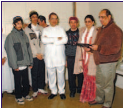
THE BHUMGARA FAMILY