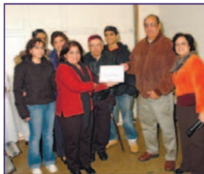
THE SORABJI FAMILY