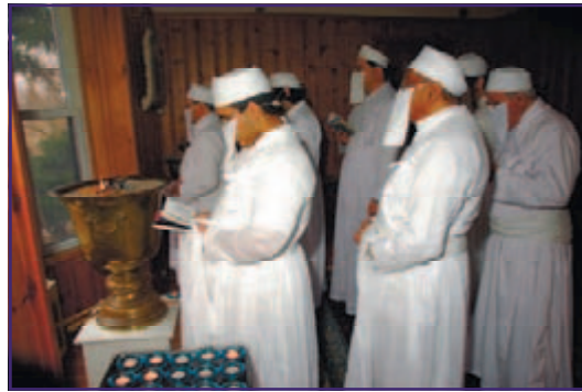
LIGHTING THE FIRE IN OUR NEW AFARGHUNYU