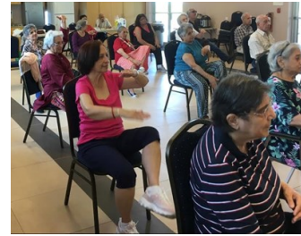
Enjoying an invigorating zumba session