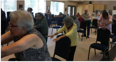
Our yoga participants in action