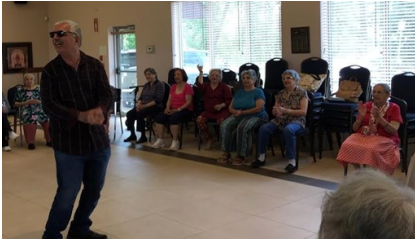
Laughter is the best medicine