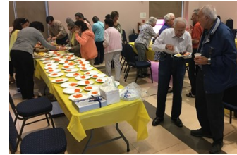
Enjoying Jalebis after the Movie Matinee